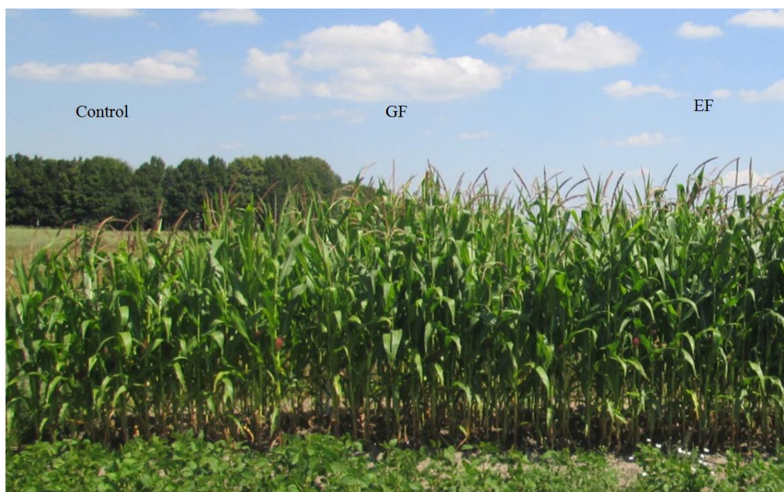
Fig. 2. General view of maize crops with various use of different mineral fertilizer types (2018)

The results of the observations are shown in Table 3.